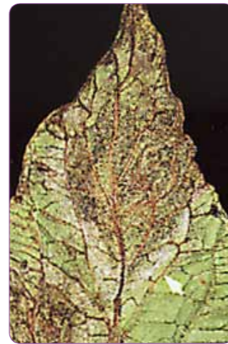
13. Late blight causes green/brown patches on the leaf of potatoes.