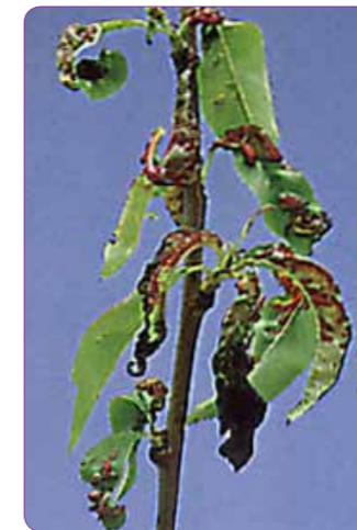
18. Peach leaf curl infects peach leaves causing them to become distorted.