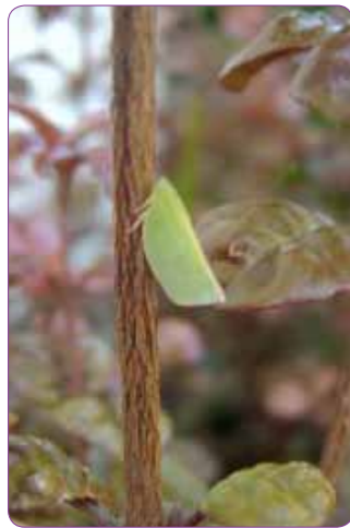
10. Leafhoppers can cause leaves to become mottled.