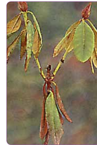
16. Phytophthora is a root disease which causes the plants to wilt.