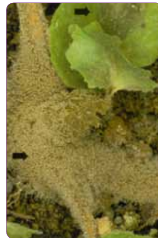
15. Botrytis or grey mould will cause stems to collapse. This disease can also infect fruit.