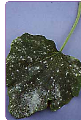
17. Powdery mildew is a common disease on pumpkins, melons and various fruits. It covers the leaf and stems in a grey white fungus.