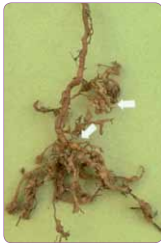
11. Nematodes attack stem, leaves and under ground parts. This can slow down the uptake of water and nutrients.